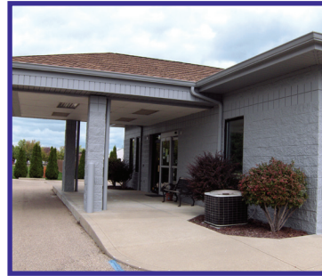
Current Hendricks County Center

Life Centers has been committed to serving Hendricks County for over 10 years. Over that time, we have moved our center for various reasons. It is time to move again because of a very important reason: increased need. Hendricks County is the third fastest growing county and has one of the highest abortion rates in Indiana.