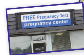
Left: Outside South Center Right: Counseling room

When the Lord called me to go back to college to study social work at age 40, I had no idea that he already had a work for me to do at Life Centers. During my senior year, January 2004, I felt led to volunteer at the South Pregnancy Center on Turtle Creek, and by August of 2004, I was on staff as the South Center Director. My heart is knit to this ministry and to our clients because I have been in their shoes. I was pregnant, unmarried, in college, and absolutely sure that my life was over before it had really begun. God has brought my life full circle. Now, through Life Centers, I can share with women and men what God alone can do if we will trust Him with our lives and make a choice for life . Christ's love and faithfulness compels me to share His goodness and the hope that is available in the midst of trying circumstances. It is my joy and privilege to serve the clients that come to our Centers.