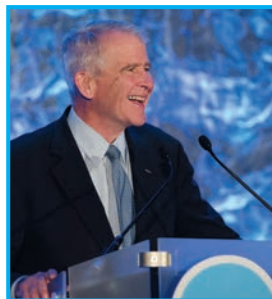
Lt. Col. Oliver L. North