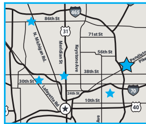
Northeast Center 7968 Pendleton Pike, Indianapolis, IN 46226