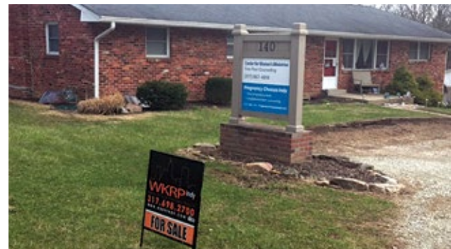
Hamilton County Center