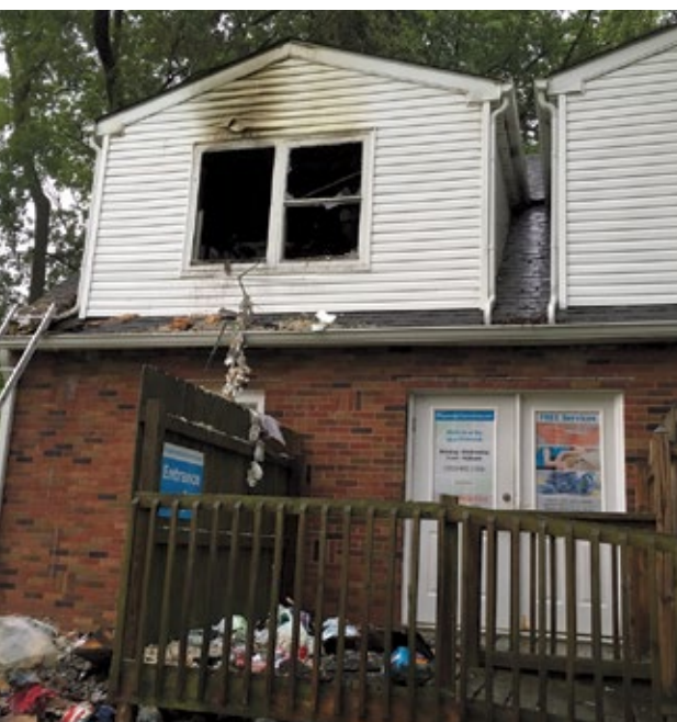
Boone County Center

Thanks to all who have donated towards these two projects. As things progress, we promise to you keep you fully informed as we work to meet the needs of the thousands who walk into our eight locations, looking for hope and love rooted in God's purpose for every life.