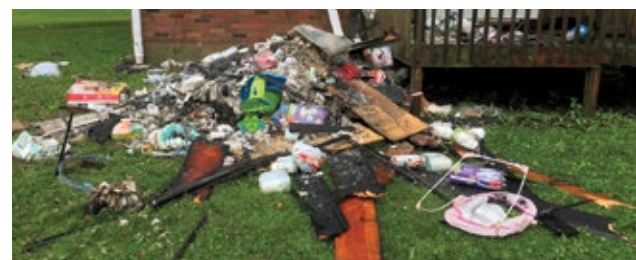
Boone County Center