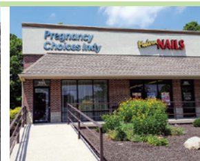
Hamilton County Center

presence back in Boone and Hamilton County. Our previous centers were only part-time, but we know that these two new full-time centers will serve the fastest growing counties in Indiana well. We can now help support and provide resources to many young women and families that need our services."