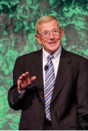
Coach Lou Holtz

“We are the good guys!” That is the message Coach Lou Holtz shared at the 2018 Celebration of Life banquet. On April 12 th , nearly 1,000 supporters came together to affirm life and hear how God is using Life Centers to share the gospel and protect the unborn.