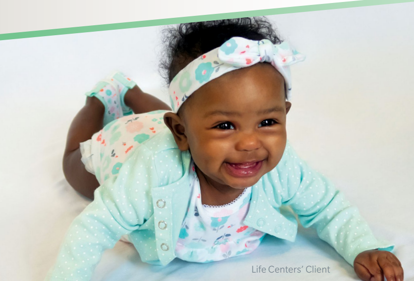
Life Centers' Client

Life Centers' goal is to save babies from abortion and transform the lives of their mothers and fathers.